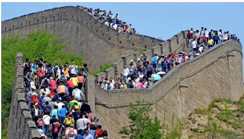
China looks set to wear the brunt of trade policy shifts by President Trump.