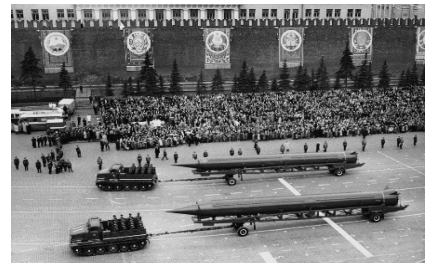
Soviet Union show of military strength in Red Square in 1961

Eric Schlosser's book, "Command and Control", is a fascinating insight into the history of nuclear weapons in the US and globally. Schlosser takes us back to the great arms race between America and the Soviet Union beginning in the 1950's. Broadly speaking, the general consensus from military and political leaders was that the real power of nuclear weaponry was in possessing them and making sure that your opponents are aware you have them, NOT actually using them. History may not always repeat but it does often rhyme and during the quarter we met with experts in this field including Stephen Hadley (21st US National Security Advisor) and Max Baucus (US Ambassador to China 2014 – 2017).