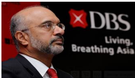
DBS CEO Piyush Gupta

With improving global economic growth and a yield curve that can only steepen from its current flat structure, we believe banks have significant tailwinds to appreciate over the next 12 to 24 months.